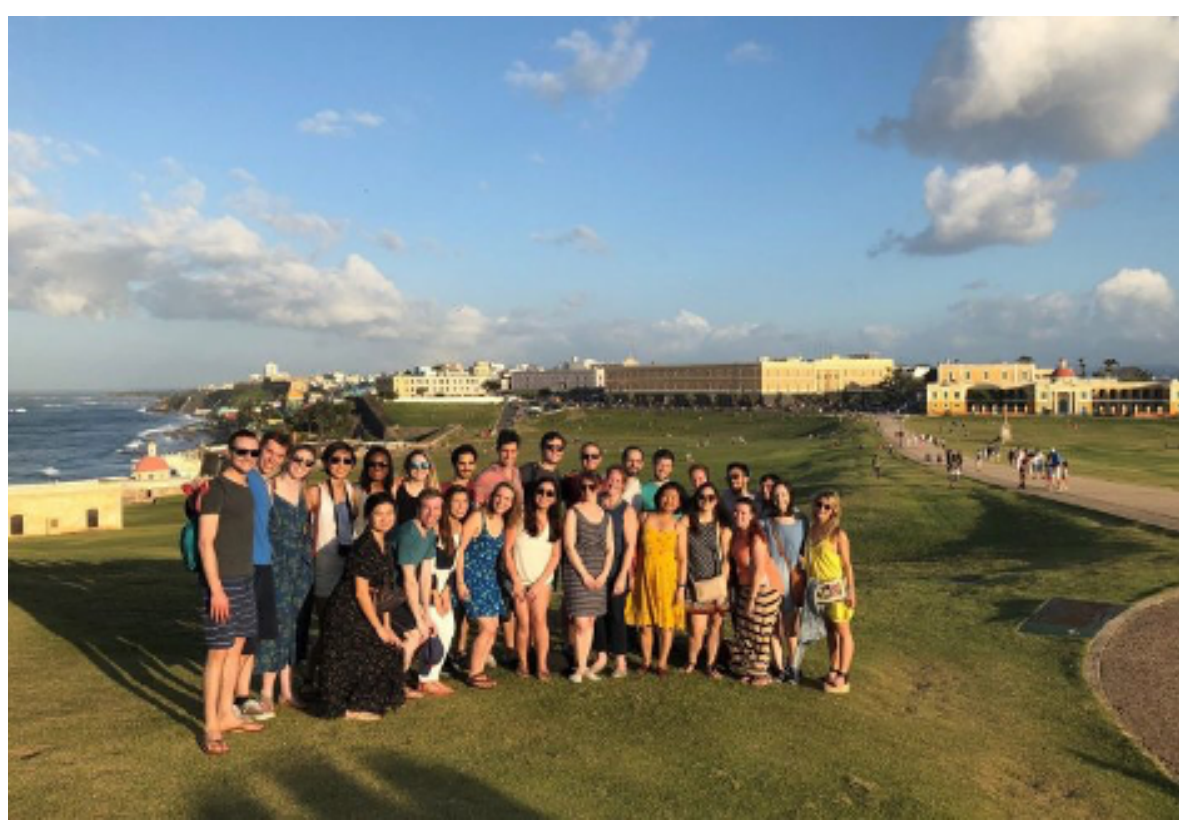
The Law School brigade outside San Juan.

excerpts taken from "Students spend spring break focused on legal services work" via Harvard Law Today