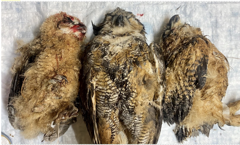
Photo: In April, this Framingham great horned owl and her owlets died of anticoagulant rodenticide toxicity. Only the father remains.

This week, the Animal Law & Policy Clinic submitted petitions urging two Massachusetts agencies to protect owls, eagles, and other wildlife from anticoagulant rodenticide poisoning.